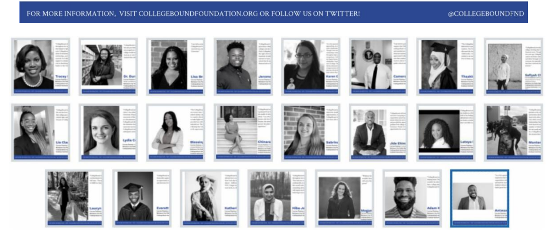
Follow us on Facebook, Twitter, and Instagram to check out this year's spotlights!

Current Position: Computer System Analyst, Northrop Grumman Corporation Baltimore City Public High School: National Academy Foundation Undergraduate Institution: Towson University