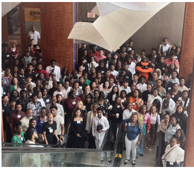
2023 Scholars' Luncheon

For the past 35 years, the CollegeBound Foundation has guided Baltimore City public school students to and through college. This year, we are particularly focusing on assisting students with job readiness, paid internships, and permanent employment.