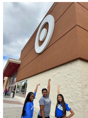
Staff members at Target while filming a promo video

Every 90 days, Target features 5 nonprofits doing good in the local community. As one of the featured organizations, CollegeBound is hoping to shed light on the successes of Baltimore City Schools' students and how we can grow to do more for them. For more information on Target Circle and how to vote for CollegeBound, visit target.com/circle .