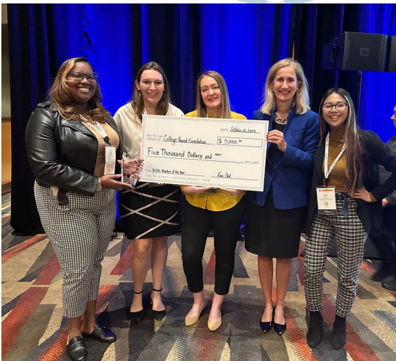
CollegeBound staff accepting the National College Attainment Network's "Partner of the Year" award

2023 has been an award-winning year for the CollegeBound team! In September, The Daily Record recognized the CollegeBound Foundation as one of the winners of its inaugural Empowering Women Award. This award recognizes companies and organizations that show a strong commitment to supporting and elevating women in Maryland by showcasing tangible and innovative efforts to advance women in the workplace and community. Currently, 89% of our senior staff leadership team are women, most of whom were promoted from entry-level positions, and our staff is predominantly women.