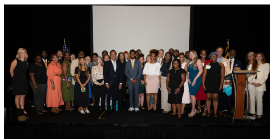
2024 CollegeBound Scholars' Luncheon

37th Annual Scholars' Luncheon: Join us this summer for our annual Scholars' Luncheon celebration on Thursday, July 31 at noon at the Hilton Baltimore. This year we will be joined by a record number of Baltimore City Schools' graduates entering our College Completion Program (CCP). Later this month, 245 Baltimore City Schools' graduates, all Pell grant recipients, will join the program. And, for the first time in CollegeBound history, we have a waitlist of over 50 students for the program. Out of the 245 students, 225 will be attending 4-year colleges and 20